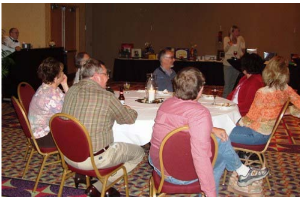
The Thursday evening event during the Fall Forum.