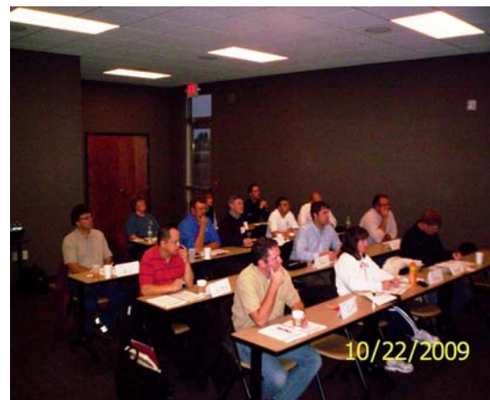
Course 200 Attendees