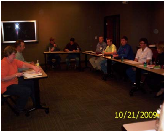
Chapter 72 Meeting