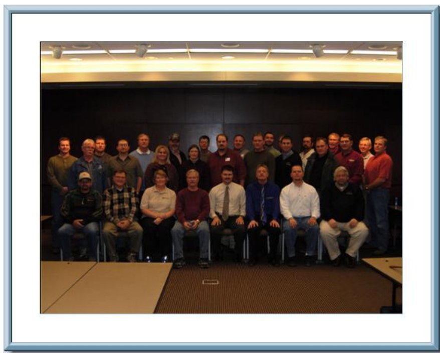
Chapter 72 membership – Fargo, North Dakota