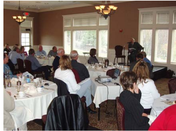
80 people attended the Chapter luncheon on October 18.