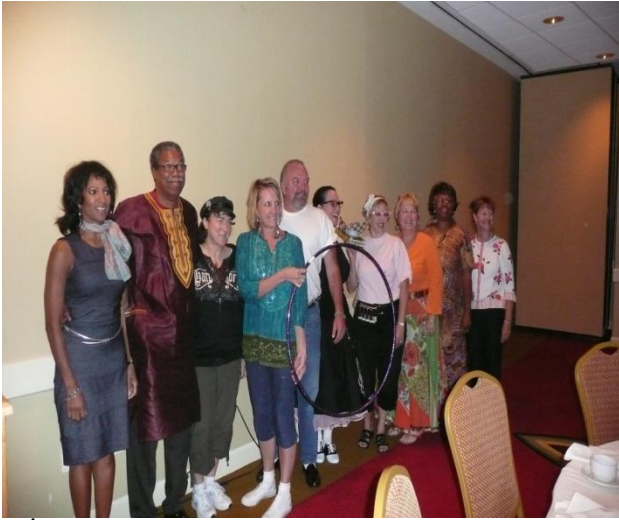
50 s Theme Participants