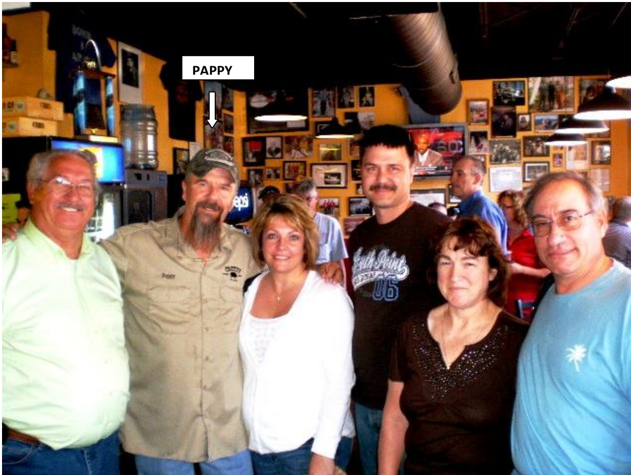
An afternoon of friendship and great food at Pappy's Smokehouse in St. Louis, MO.