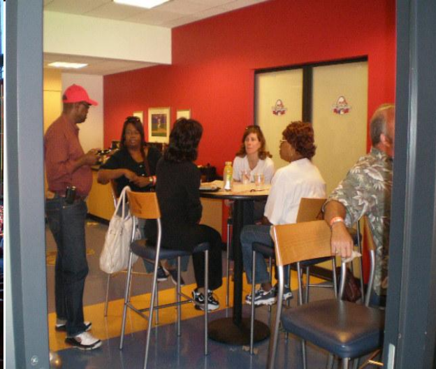
Fine accommodations by Chapter 37