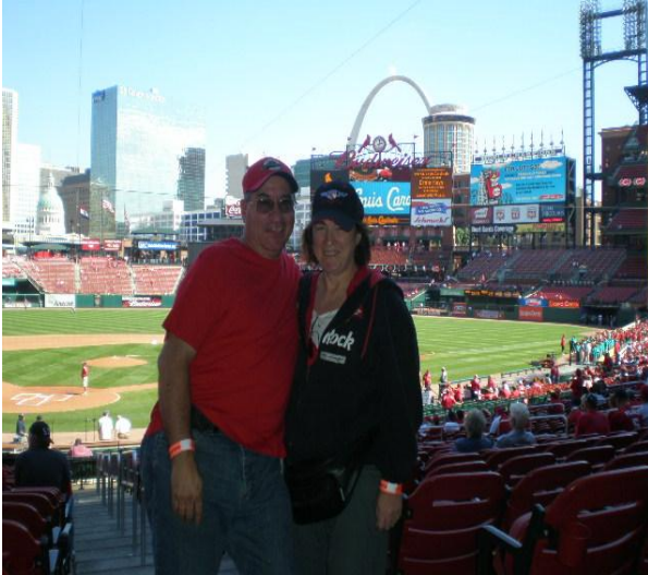
The perfect picture!