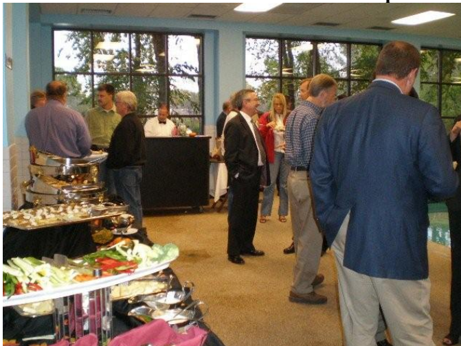
Plenty of food and fun!