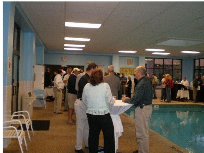
Various Chapter members mingling with other members and guests