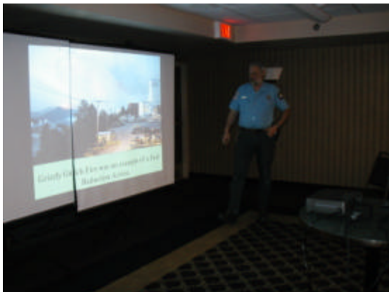
Deadwood Fire Department gave us a very good presentation on the BlackHills Fire--July 2002