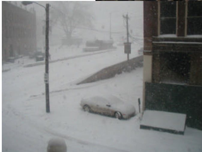
Deadwood, good old snow storm: How many of you remember this?