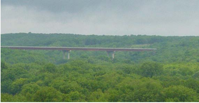
Iowa River Bridge