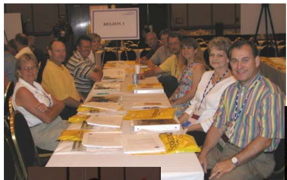
Region 3 Board of Director's Meeting