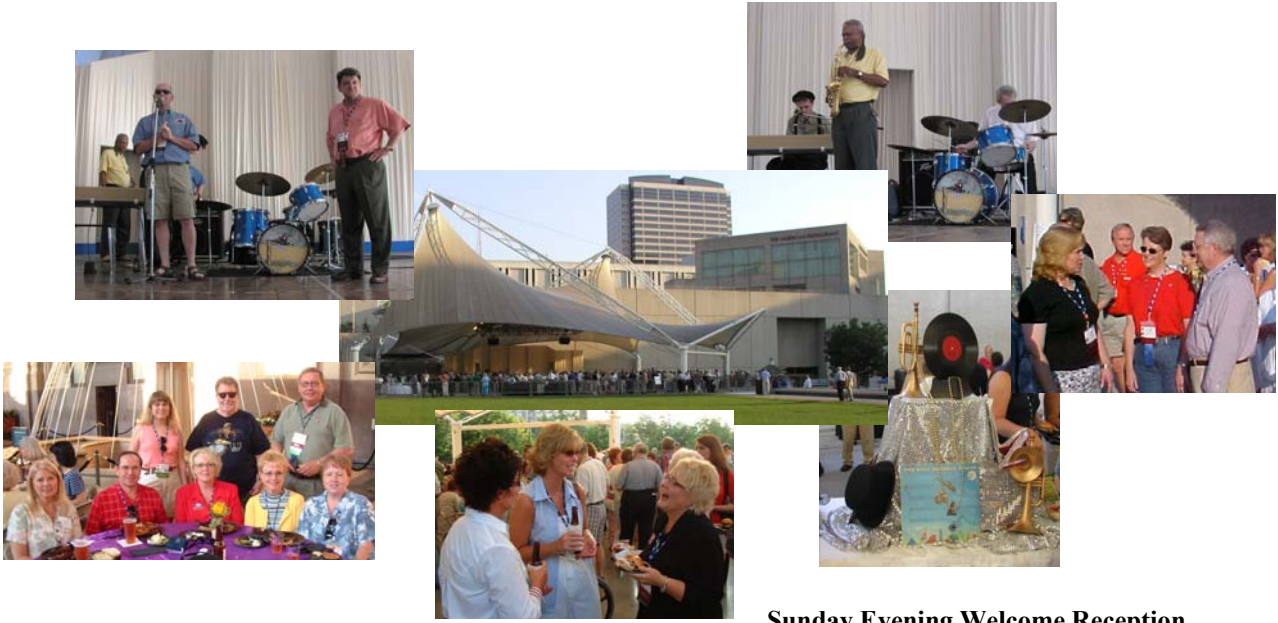
Sunday Evening Welcome Reception