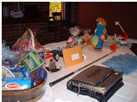
Table of donated items for the auction