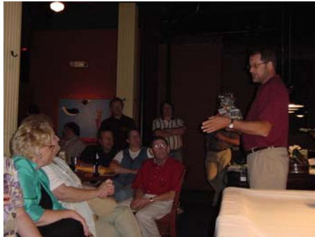
Now 40, now 45, now 50!