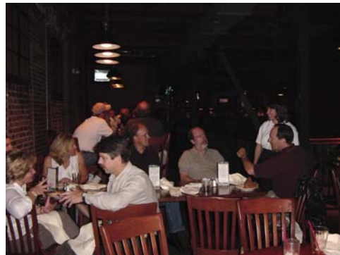
Various conversations all at once.