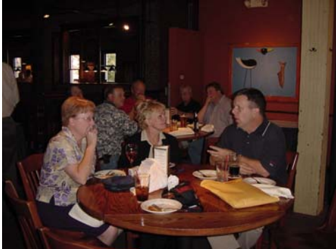
Listening intently in the conversation.