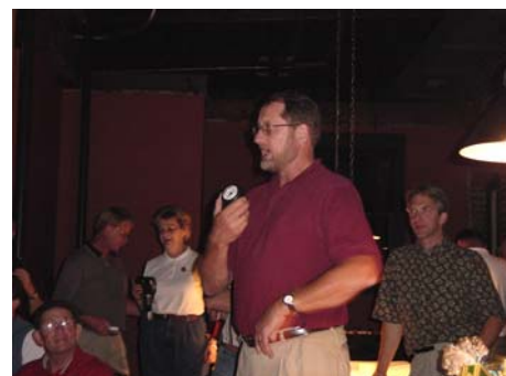
Auctioneer extraordinaire getting the money