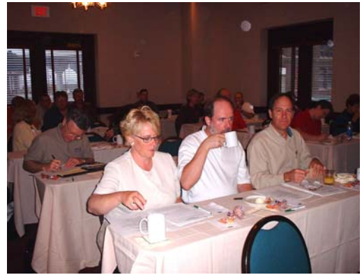
Some participants waiting for forum to start