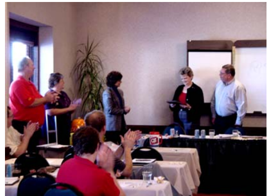
Chapter 5 gives a plaque to Chapter 41 for their work on the Auction night at the KC Seminar.