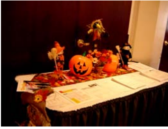
Fall decorations on the reports table