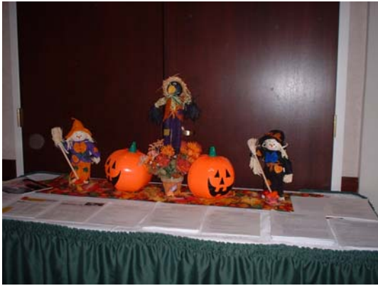
Table decorations for handouts at forum.