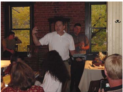
Dr. talks about Lewis & Clark Trail.