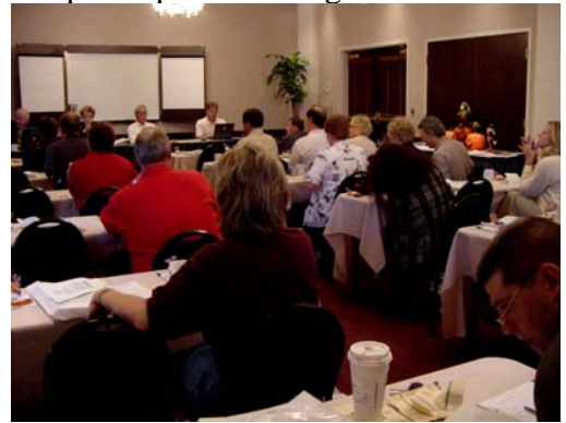
Attendees listen intently on Chapter reports.