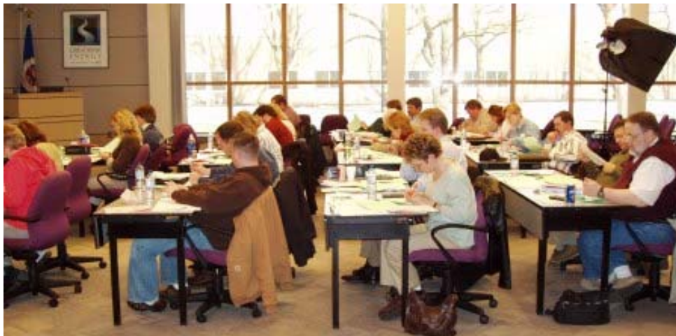
Course 902 - Property Descriptions

Please contact the Course Coordinator prior to attending a course for information on Real Estate, Appraisal or Legal continuing education credits. PLEASE, DO NOT assume that all classes offer continuing education credits.