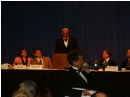
Legendary Buck O'Neil at luncheon