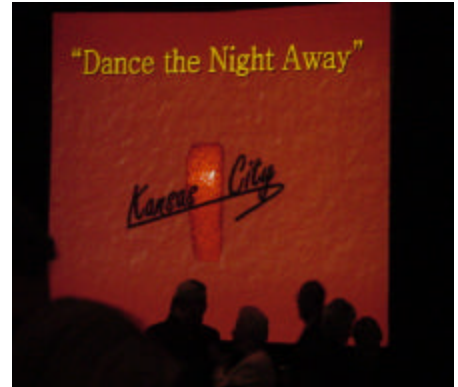
Presidents Ball after dinner.