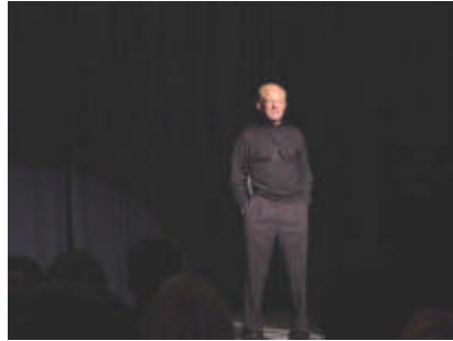
Retired POW Captain Charles Plumb.