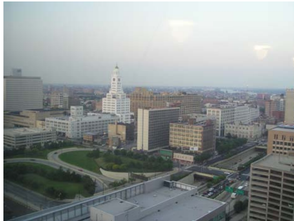
View towards NJ from host hotel

Soon we were on our way to classes. This year, we again found a variety of sessions to accommodate everyone. These included, for the highway industry: Highways, Byways and Private Roads and Highways for Profit; for energy and utilities: Wind Power - Blowing in the Wind; the Impact of Wind Farm Siting on Property; Utility Issues in the Design Process and Blackouts: Are There More To Come?; along with Urban Forests and Utility Lines, Can They Co-exist?; for the Environmental industry: Turning Brown Fields into Green Fields and Environmental Pitfalls in Project Permitting; for the Appraisal industry: Appraising Historic Properties, Valuing Blue Sky, and the Valuation of Avigation Easements. There were numerous Canadian courses, Relocation courses, Developing PowerPoint Presentations and Managing Stress in the work place sessions.