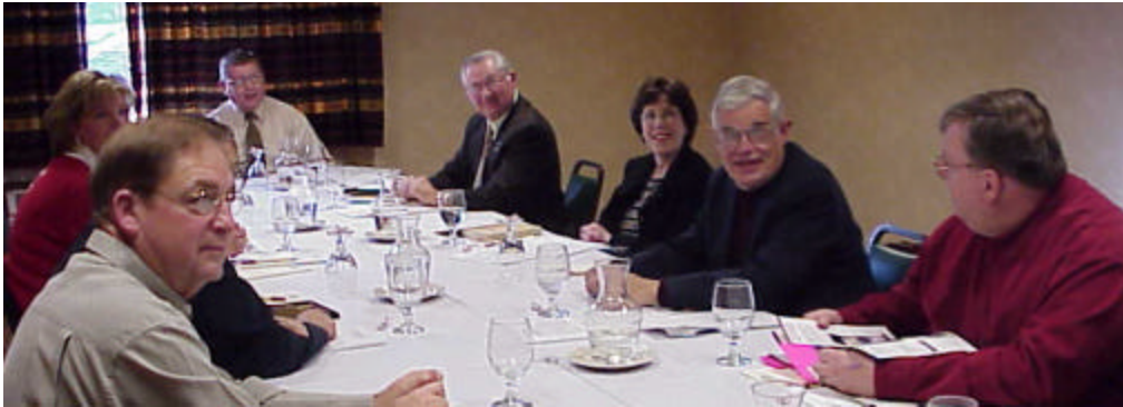
Chapter Board Meeting